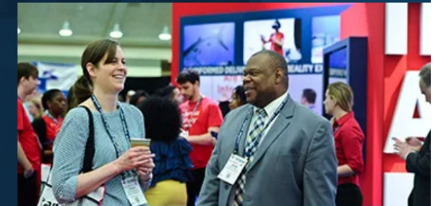
RESERVE A BOOTH