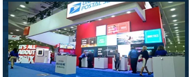
EXHIBITORS AND FLOORPLAN